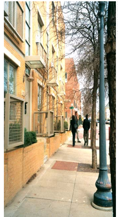
The diversity of paving and plantings create a vibrant pedestrian experience.

Form-based coding often is implemented through a “parallel” approach where new codes are applied as an option to existing codes. Incentives for using the form-based option, including expedited permitting processes and tax breaks, can enhance its appeal to developers and lead to implementation. Developers and architects praise the clarity of a form-based code and the more predictable, streamlined review process. Also, citizens value the opportunity to shape their communities through public design charrettes. Still, adoption and implementation of form-based codes requires considerable political will to overcome skepticism among politicians and creditors.